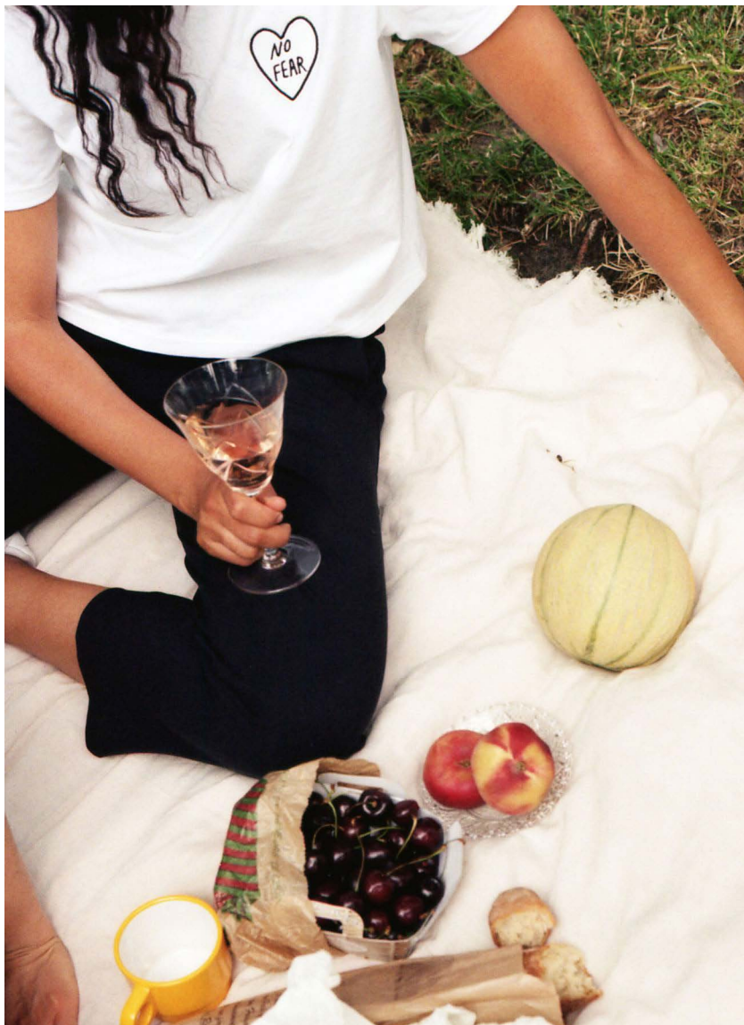
No Fear t-shirt, 100% organic cotton