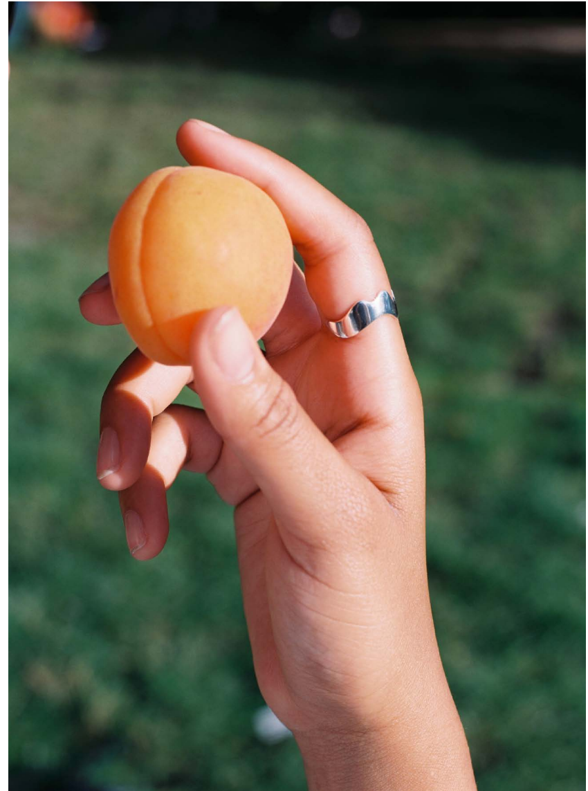
Milky Way ring, recycled 925 silver