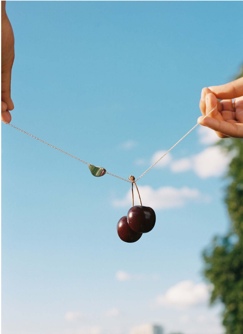
Orbit necklace, recycled 925 silver