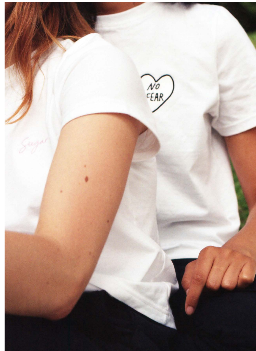
Sweet as Sugart-shirt, 100% organic cotton