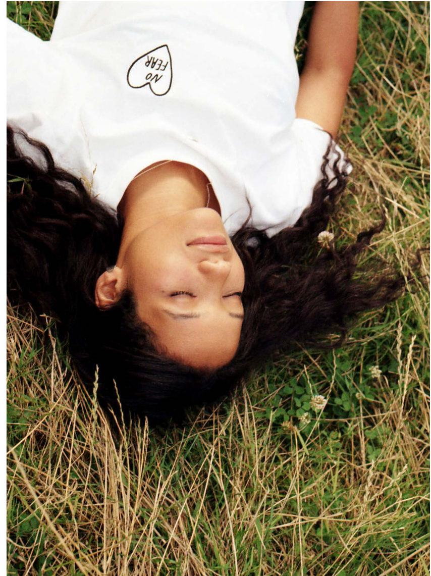
No Fear t-shirt, 100% organic cotton