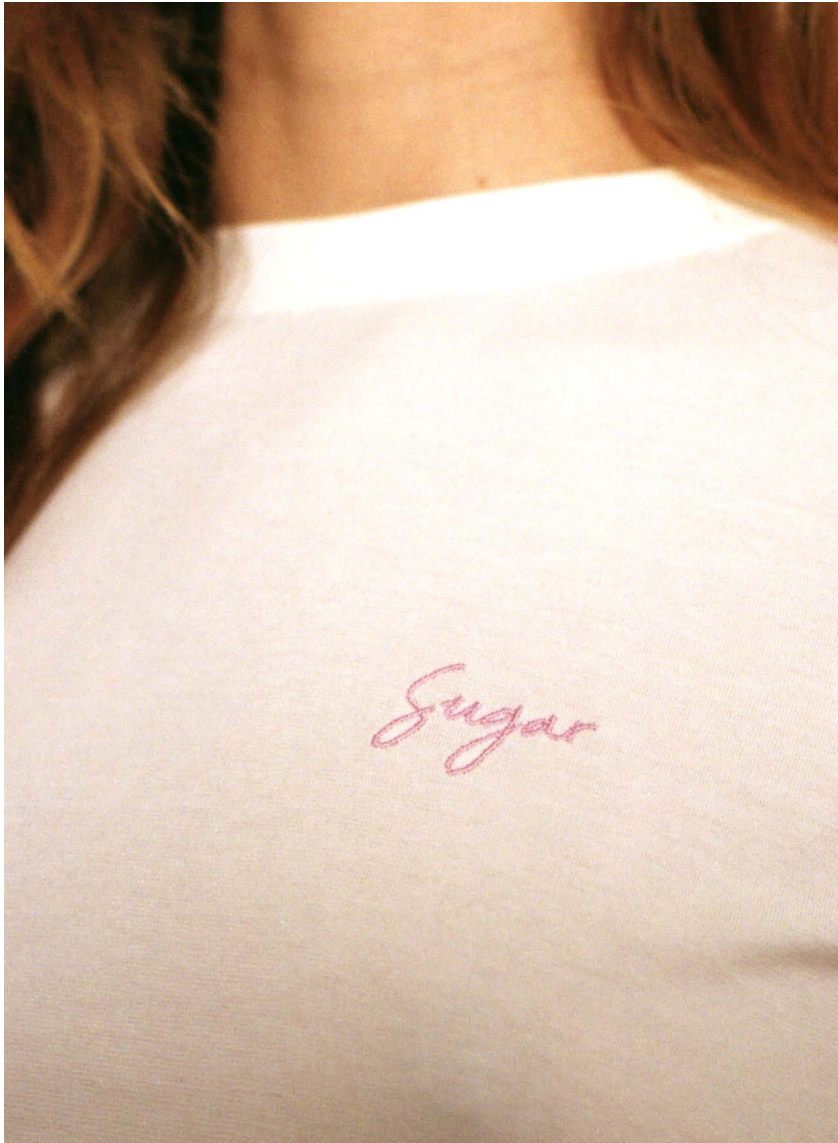
Sweet as Sugar t-shirt, 100% organic cotton