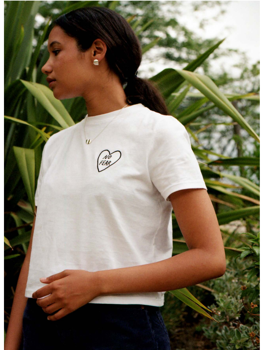
Pluto earrings, recycled 925 silver